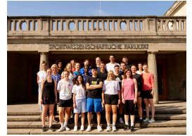
2024 Leipzig PhD Course Group Photo

From September 2nd to 6th, 2024, Leipzig University in Germany hosted the PhD course titled Research Methods, Publication Strategies, and Career Perspectives in Sport Psychology . IAAP members were involved in this international event, which brought together early-career researchers from 11 universities and 10 nationalities.