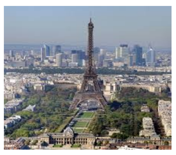
Figure 3. Panoramic view of Paris

And, last but not least, the Sorbonne , the original nucleus of the University of Paris – now enriched with near two dozen of independent similar organisms in the big urban area- , soon included the chairs and laboratories where psychological research could be carried out seriously.