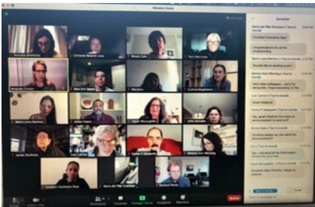
Presentation of the Early Career Marathon Project during a meeting with GPA members

This is an excellent opportunity to learn about psychological research from the new generation of psychologists around the world and for young researchers to gain valuable mentorship from their distinguished colleagues.