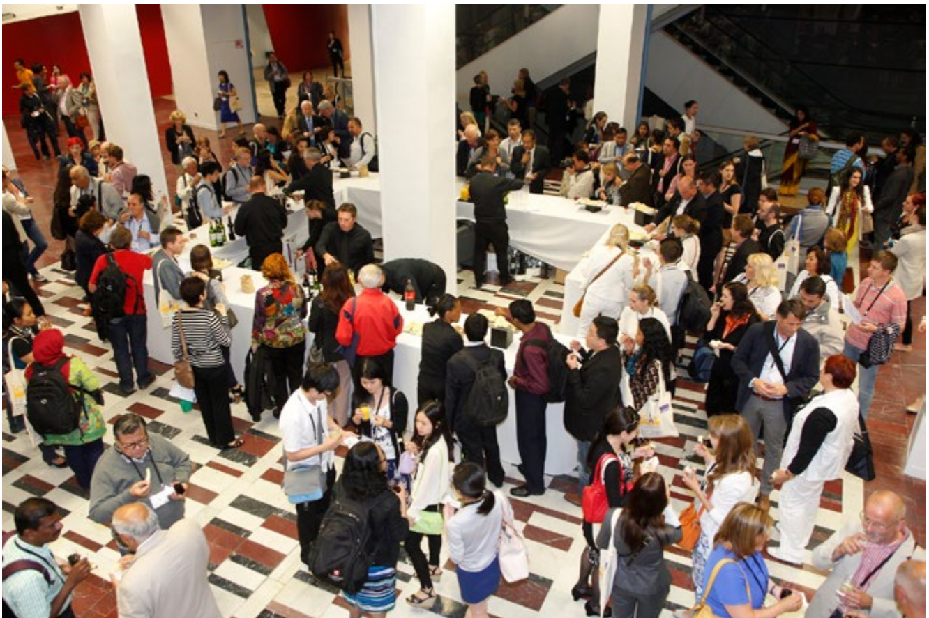
International Congress of Applied Psychology, Paris 2014

Detailed information about membership and instructions on how to submit an application can be found on the IAAP website .