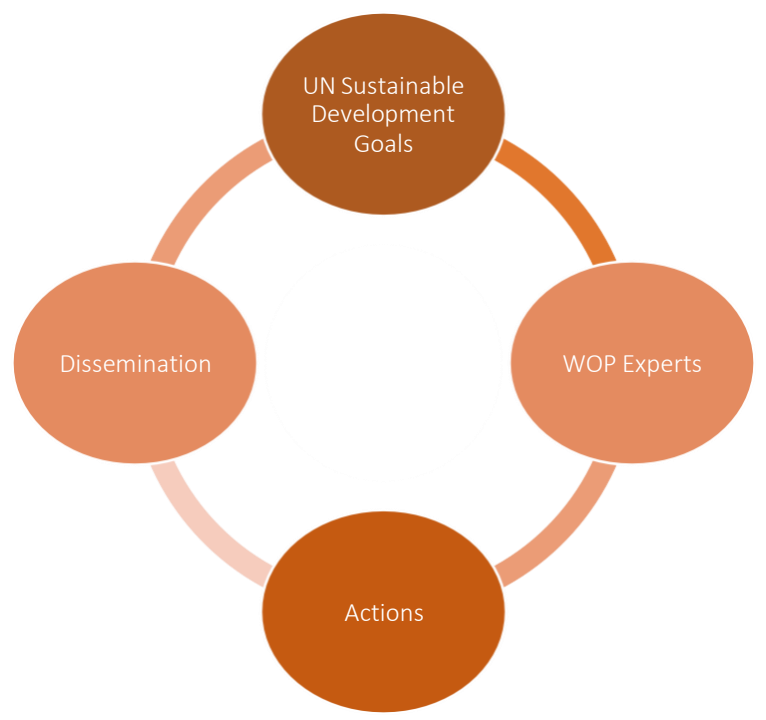
Figure 1. The Circle of "This works in my place!"

1-The first step (starting point of the project) was the set of Sustainable Development Goals. Of them, the project focused on five: "no poverty", "good health and well-being", "gender equality", "decent work", and "innovation". The selection of these goals was based on their connection to the WOP discipline. In other words, actions associated with the research and practice of WOP are more related to these goals than to the others established by the UN.